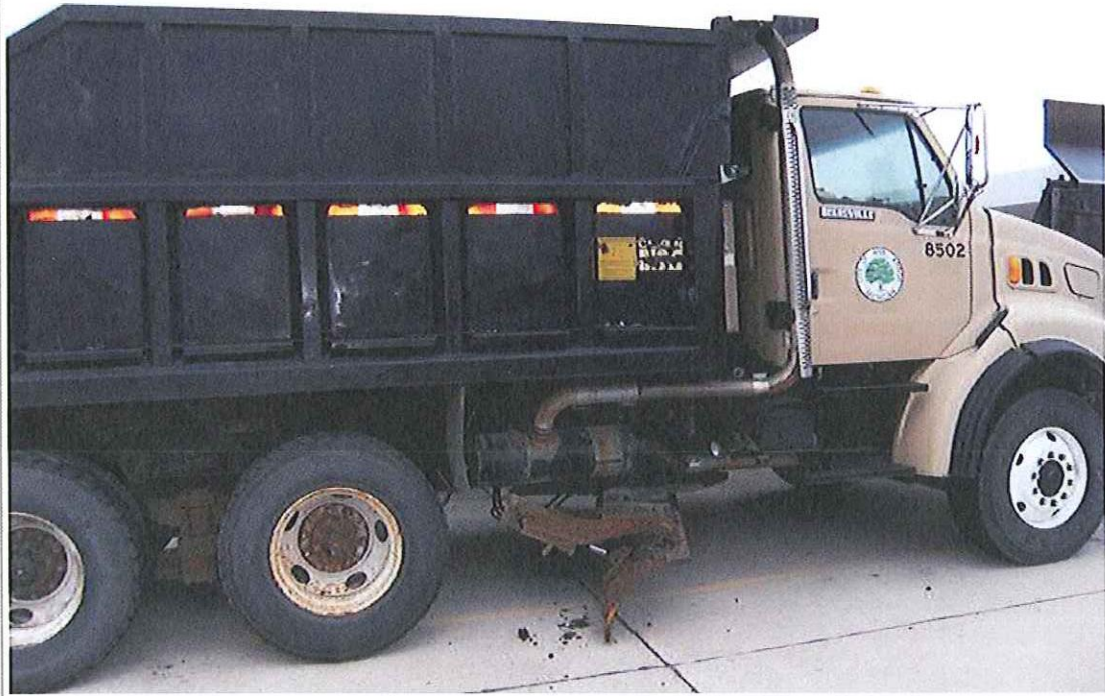
Copyright © International Data Base Corp. 1983-2012 - All rights reserved