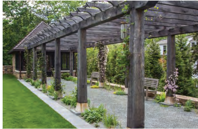
PRIMARY TRAILHEAD WITH PERGOLA