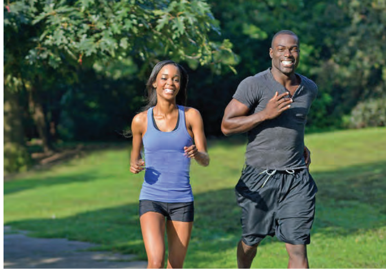
B2B MULTI-USE TRAIL CONNECTOR