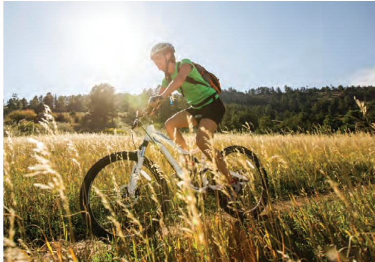
MULTI-USE TRAIL LINK & NATURAL PRAIRIE