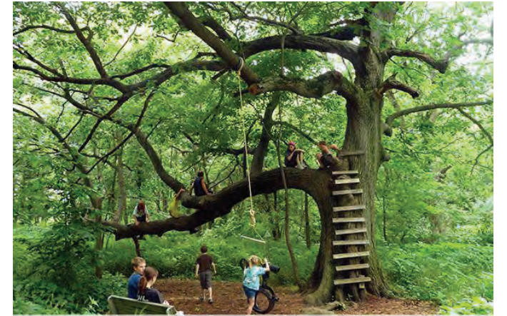
NATURAL PLAY AREA