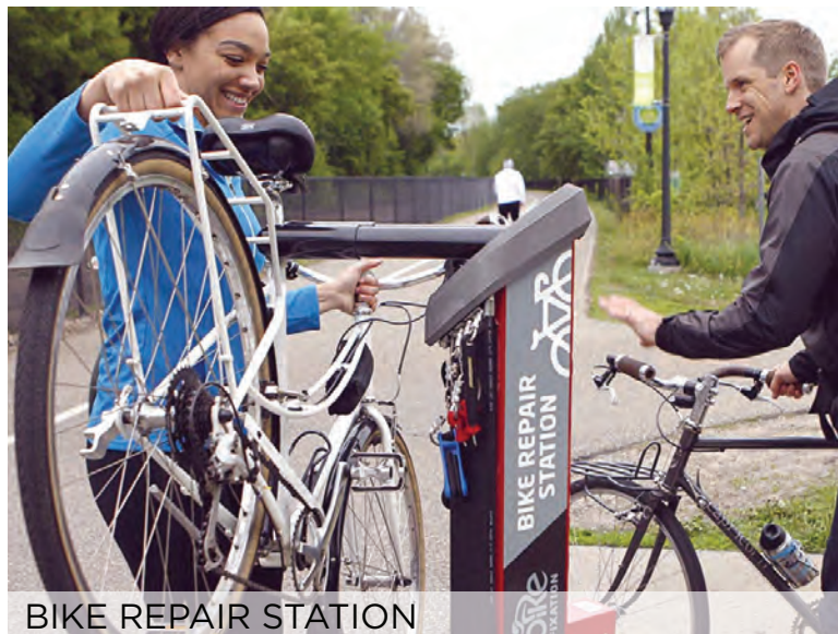
BIKE REPAIR STATION