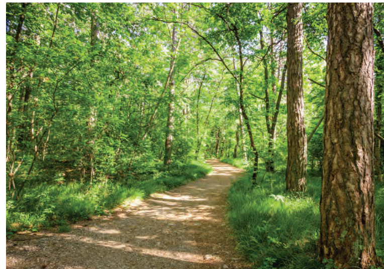
PEDESTRIAN HIKING LOOP