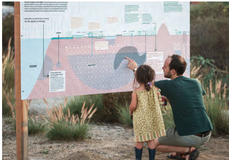
INTERPRETIVE LEARNING STATIONS