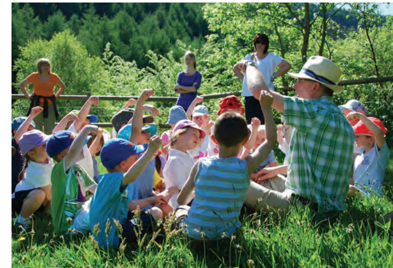
OUTDOOR CLASSROOM OPPORTUNITIES