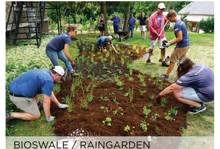
BIOSWALE / RAINGARDEN