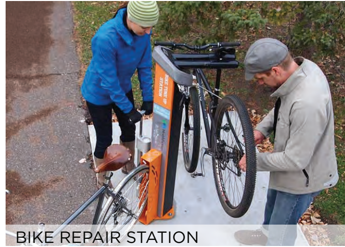
BIKE REPAIR STATION