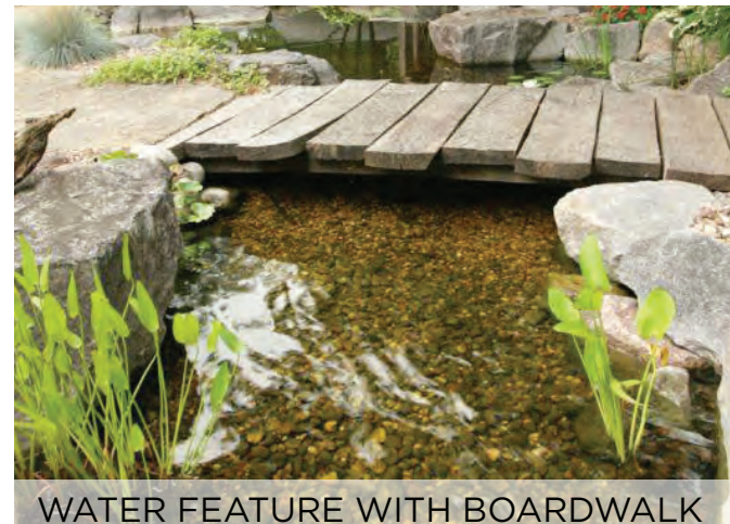
WATER FEATURE WITH BOARDWALK