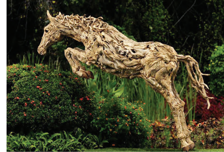
ART IN THE LANDSCAPE